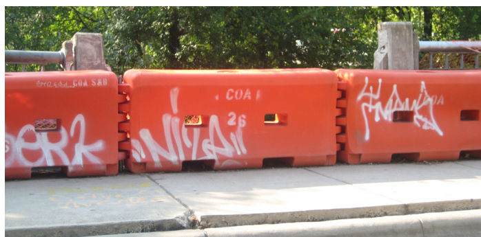
Railing repair planned for this summer near Barton Springs Road Bridge.

The bridge is in poor condition and the city wants to replace it. It is a named project in the bonds package