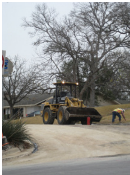
Work continues on Rockingham at Barton Skyway (above), while the Butler Trail entrance nears completion (right).

Why not start this tradition on your street and get the great benefits? The more events like this, the better for our wonderful Barton Hills community. ♡