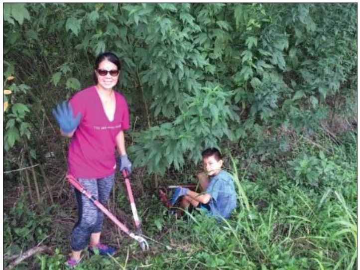
Below: September Keep Austin Beautiful workday. Volunteers chopped down ragweed, made and spread wildflower seed bombs and prepped for the fall pond planting.