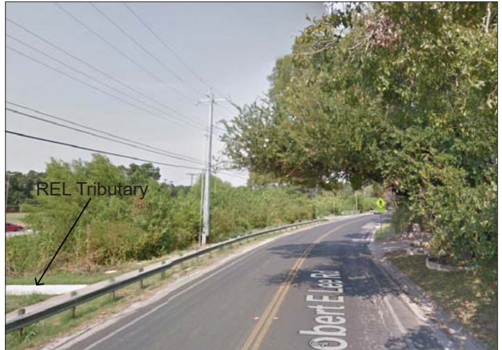
Above: The tributary along Robert E. Lee